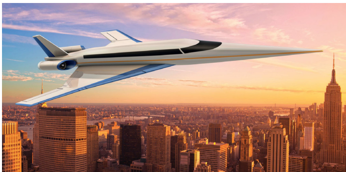
The Spike S-512 Supersonic Jet will fly from NYC to London in 3 hours

Spike Aerospace is a fast-growing engineering firm developing the world's first supersonic business jet with Quiet Supersonic Flight technology. Spike runs hundreds of complex CFD simulations to understand the aerodynamic performance of their aircraft. CFD simulations are computationally intensive and traditionally require significant investment in on-premise infrastructure, tens of thousands of hours of runtime, expensive software license fees, and a team of hardware experts to optimize the HPC. The fixed capital costs for such compute- and time-intensive simulations would have been prohibitive under the traditional paradigm. To quickly get up to speed without investing in significant infrastructure, Spike Aerospace partnered with Rescale to migrate 100% of their CFD process to the cloud. As a result, they have realized massive cost and time savings.