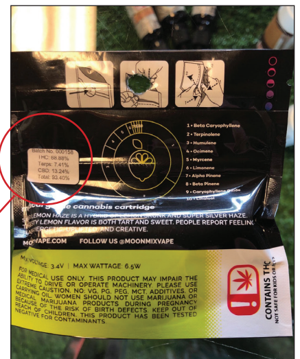
Batch number labels on product.