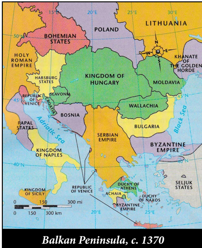
Balkan Peninsula, c. 1370

People find many motives for this conflict. Valuable resources or vital trade routes can lead people to fight for economic control of a region. Different political philosophies may lead groups to compete for power. Religious or ethnic differences also can bring cultures into conflict. Migration and changes in patterns of settlement often play a role as well. The Balkan Peninsula in southeastern Europe is one region where most, if not all, of these factors have led to conflict over territorial borders. For thousands of years the peninsula has been an unstable region of divided loyalties, frequent conflict, and changing boundaries.