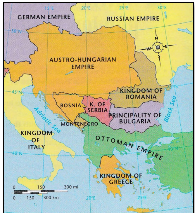
Balkan Peninsula, 1885

After the war, the victorious Allied nations established new countries in Europe. One of these was the Kingdom of the Serbs, Croats, and Slovenes, later called Yugoslavia. The monarch of the new multinational country was the king of Serbia. In the 1920s, King Alexander tried to unite the nationalities by forcing them all to use one language, Serbo-Croatian. He also created new political boundaries that ignored the ethnic groups' historical territories. Alexander's actions worsened relations between the groups. In 1934, the king was assassinated by a Macedonian from Bulgaria who was supported by Croatian revolutionaries. As you have learned, conflict and changing boundaries are still a part of the Balkans today.