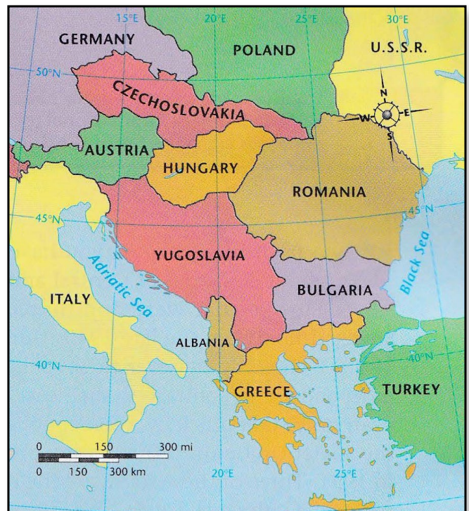
Balkan Peninsula, 1920