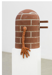
Judith Hopf Personification of a Problem 2015 bricks, cement, red clay 64 x 43 x 44,5 cm