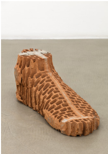
Judith Hopf Brick-Foot 2015 bricks, cement, red clay 25 x 68 x 25 cm

Please note that all the images must be credited as: