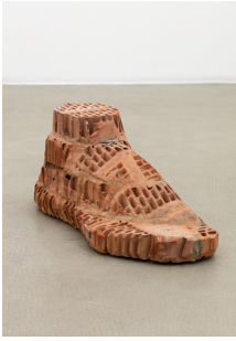
Judith Hopf Brick-Foot 2015 bricks, cement, red clay 31 x 78 x 33 cm