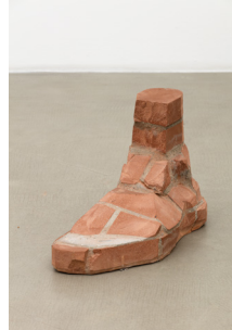
Judith Hopf Brick-Foot 2015 bricks, cement 37,5 x 61,5 x 25 cm