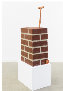
Judith Hopf Brick-Trolley 2015 bricks, cement, red clay 79 x 38,5 x 24,5 cm