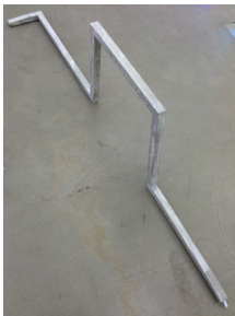
Judith Hopf Untitled (Serpent) 2015 concrete, metal, newspaper 54 x 200 x 23 cm