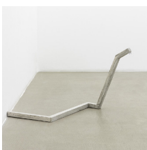
Judith Hopf Untitled (Serpent) 2015 concrete, metal, newspaper 56 x 100 x 57 cm + 84,5 x 1