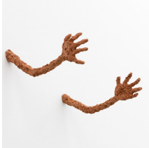
Judith Hopf Untitled (Pair of Arms) 2015 red clay 50 x 45 x 20 cm