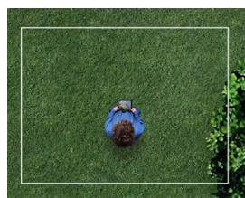
Judith Hopf More 2015 video 04'33"