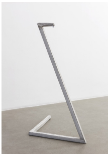
Judith Hopf Untitled (Serpent) 2015 concrete, metal, newspaper 113 x 94 x 55 cm