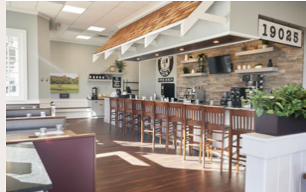
Turning Point - One mile from office