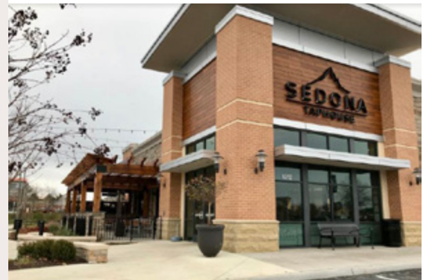
Sedona - One mile from office