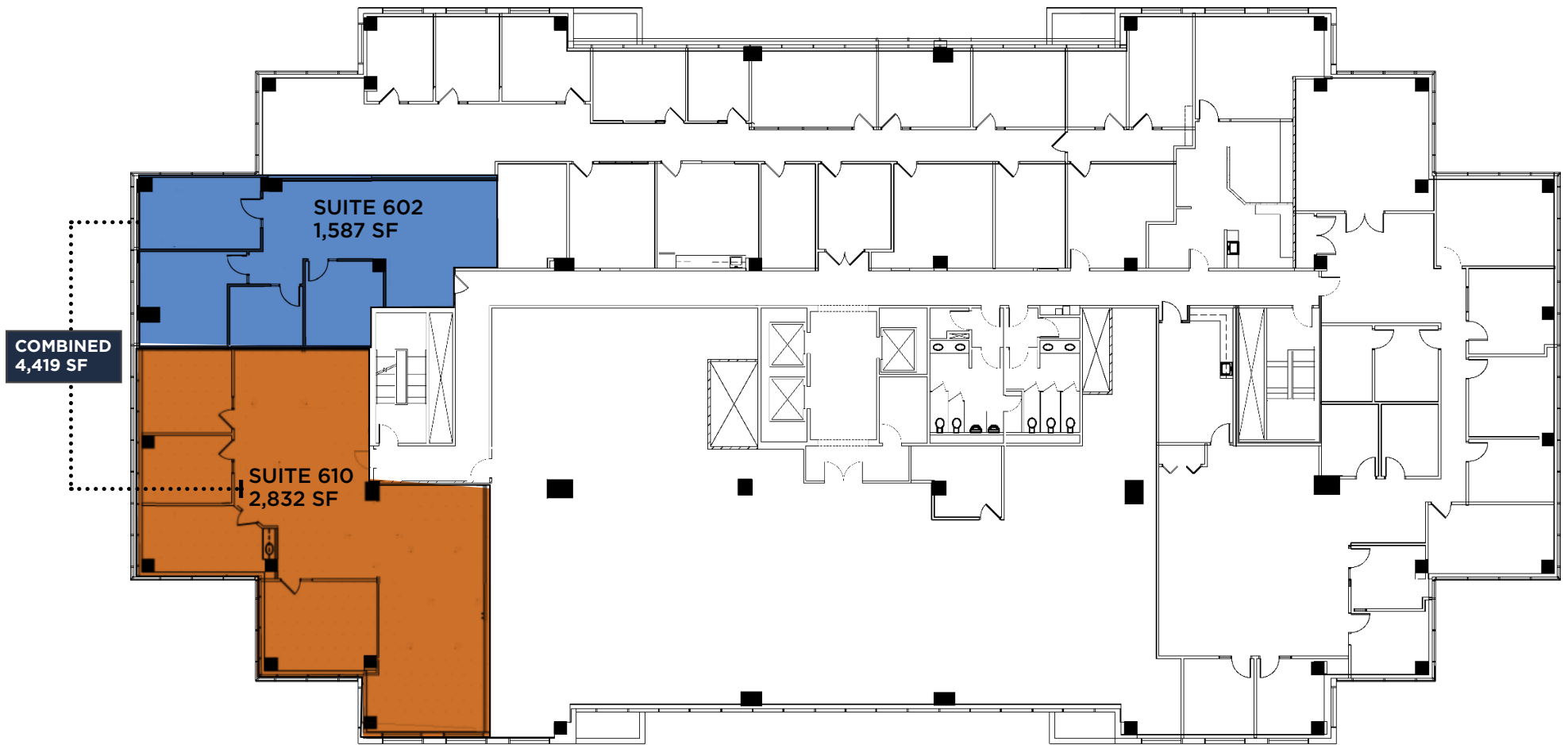
BOULDERS III - 6TH FLOOR