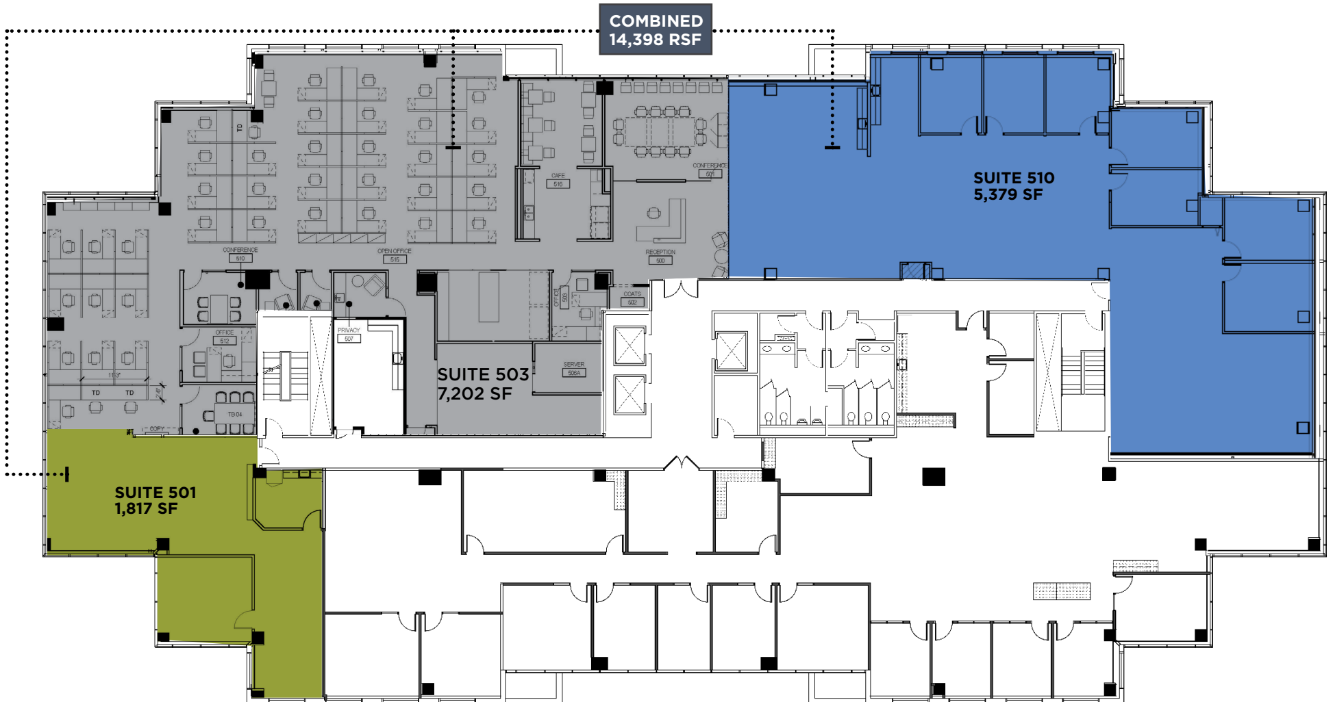
BOULDERS III - 5TH FLOOR