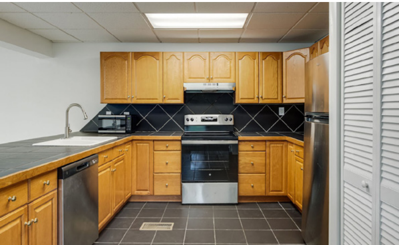
2ND STORY NEWLY RENOVATED TWO BEDROOM APARTMENT