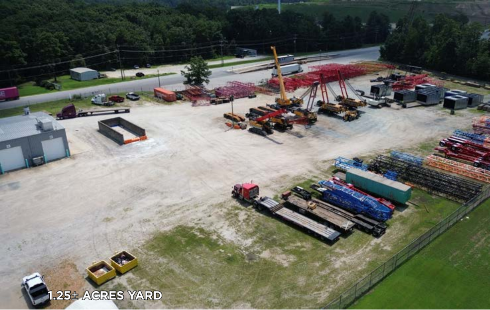
1.25± ACRES YARD