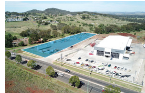
373 Anzac Avenue, Harristown

Demand from investors has remained strong with net yields of between eight and nine per cent