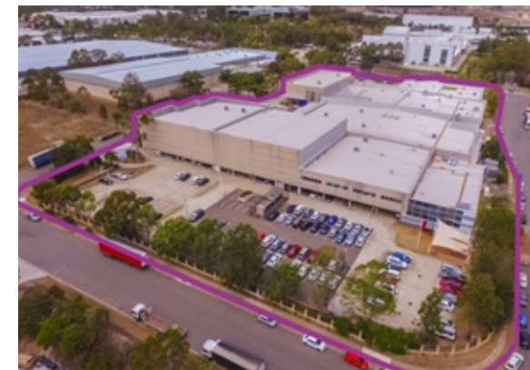
60 Huntingwood Drive, Huntingwood

Some of the larger industrial holdings to transact this year include 60 Huntingwood Drive, Huntingwood.