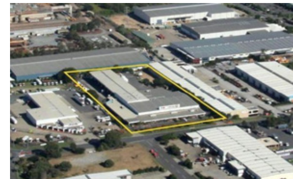
147 Archerfield Rd, Richlands sold for $14 million with a passing yield of 6.77%. It was leased to Vermeer on a 10 year term and had recently undergone a significant refurbishment.