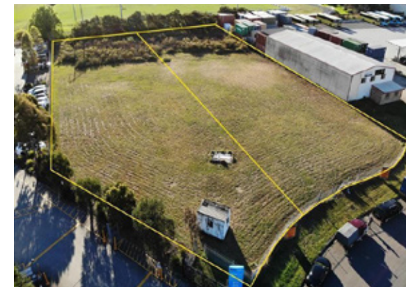
17 & 19 Aluminium Close, Edgeworth

Recent auctions by leading local commercial agents in Newcastle show that we are increasingly entering into a two tier market. In this case, the two tiers can be described as the lower tier being property that perhaps has a small local business as a tenant without a long term lease in place, property in a secondary location or buildings that may be showing wear and tear and require capital expenditure to bring them up to a better standard. The upper tier properties are the opposite of the above, with long term tenancies in place to government or strong corporate tenants, in good established locations and in good condition.