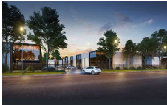
'The Base', 10 Cawley Road, Yarraville.

We have also seen increased demand for large scale warehousing and distribution facilities, particularly in