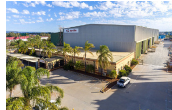
100 Chisholm Crescent, Kewdale

Discussions with real estate agents active in the sector also confirm the softening in demand for vacant industrial land. Feedback suggests the lack of demand tends to be a function of the very limited