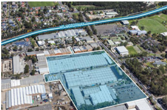
286 Horsley Road, Milperra

In Sydney's south-west, private property developer Leda Group has paid $52 million for an industrial site