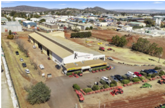
318 Taylor Street, Glenvale