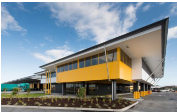
Noteworthy transaction this year: 71 Charles Ulm Place, Eagle Farm in July with a sub-six per cent yield. It sold for $35.5 million with a passing yield of 5.89 per cent with a five-year term certain leased to Oz Trail.

Significant new deals include CTI Logistics who took circa 10,500 square metres at Wayne Goss Drive,