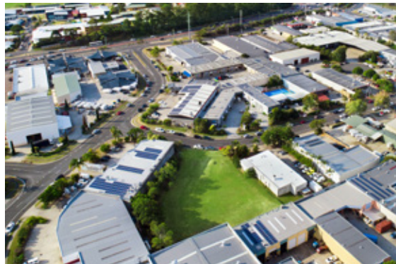
3 Flagstone Dr, Burleigh Heads

In conclusion, the industrial market on the Gold Coast over the past year has gone from strength