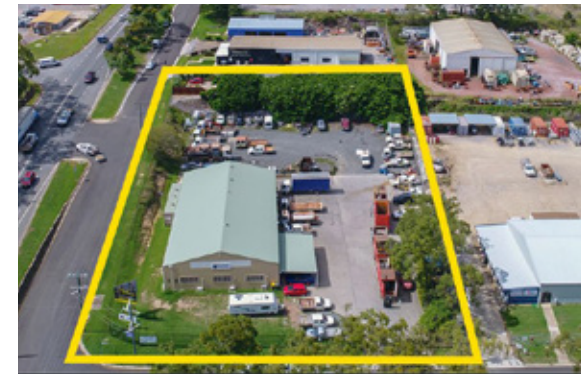
1 Anson Close, Toolooa

2018 also saw the continued activity of investors to the market, which appeared to kick off in late 2017. The passing yields show a range of about 12 to 13 per cent on some of the more notable