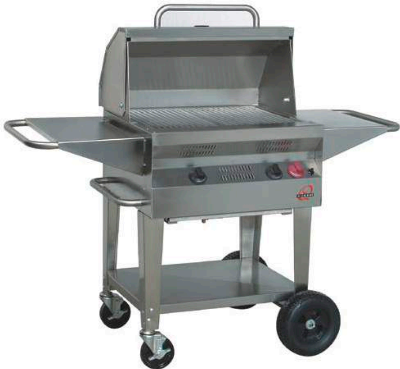
Model shown is TG24RC, with optional stainless steel side shelves and smoke hood

The TG24RC is designed for smaller gatherings with portability in mind, while offering all the features of the larger BUBBA Q™ commercial gas grills. Two stainless steel side shelves and other options round out the complete package.