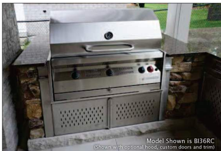
Model Shown is BI36RC (Shown with optional hood, custom doors and trim)