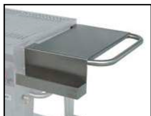
Stainless Side Shelf with Sauce Tray