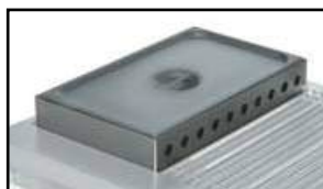
Stainless Steel Steamer Pan