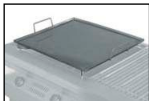
Removable Stainless Griddle