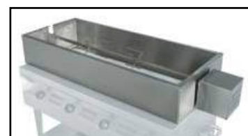
Rotisserie Kit - 48"