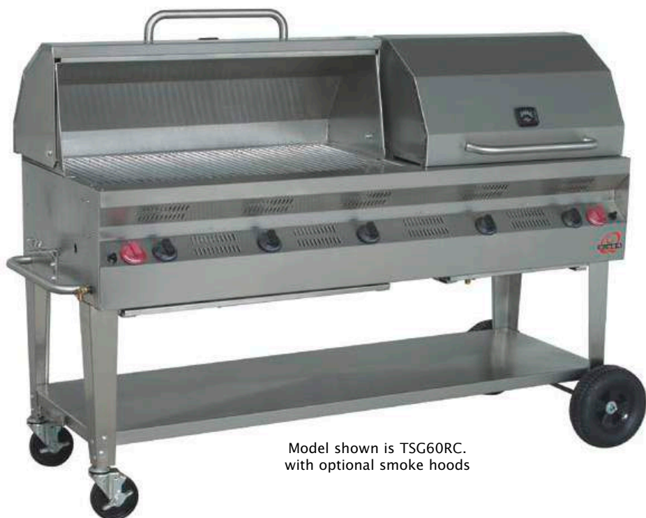
Model shown is TSG60RC. with optional smoke hoods