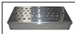
Stainless Steel Smoker Box