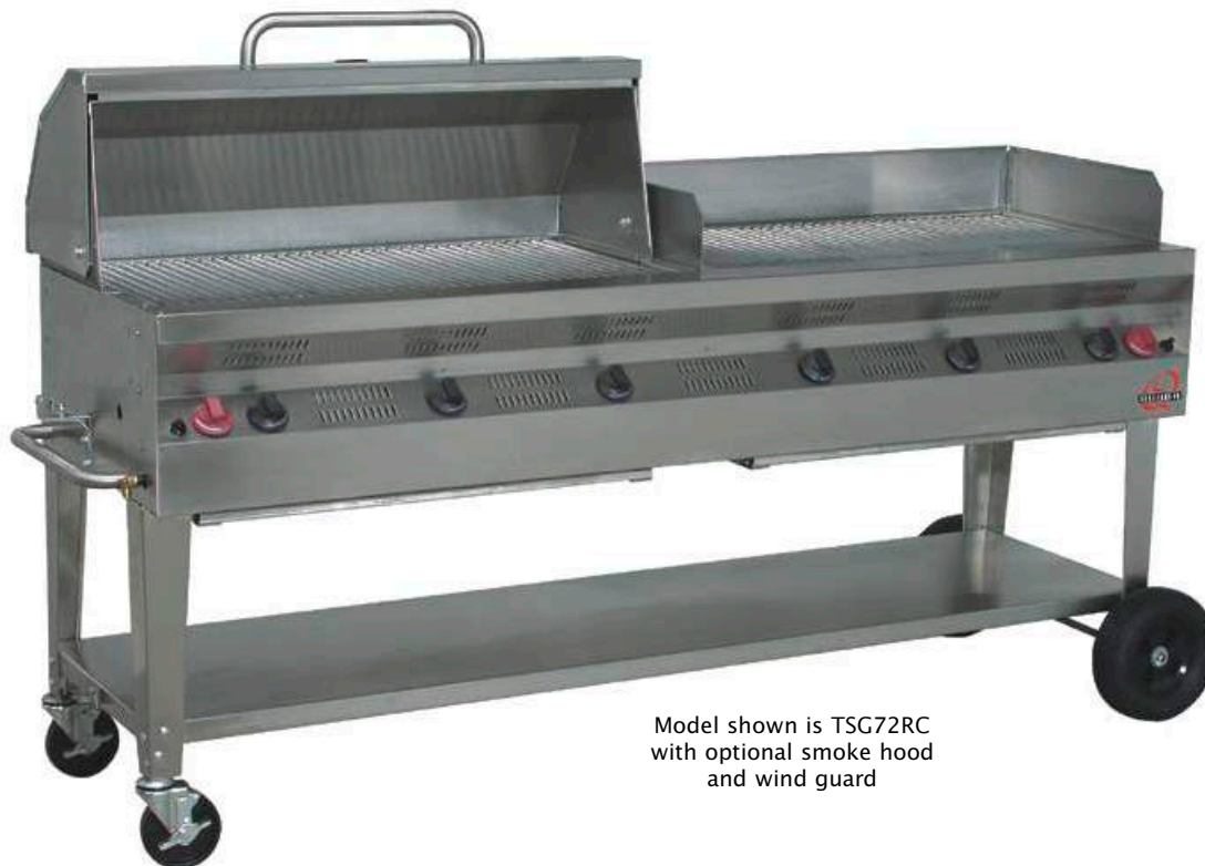
Model shown is TSG72RC with optional smoke hood and wind guard

TSG60RC comes with two individual cooking compartments. 1-24" wide 1-36" wide