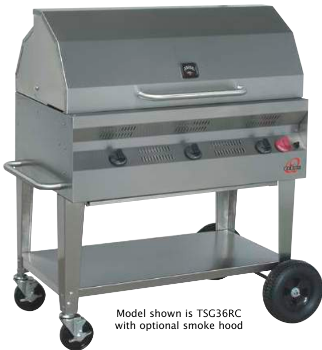
Model shown is TSG36RC with optional smoke hood

has three burners and 756 square inches of cook surface designed to meet the needs of larger groups.