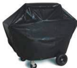
Heavy Duty Vinyl Cover