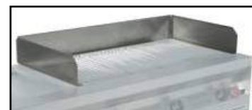
Stainless Steel Wind Guard