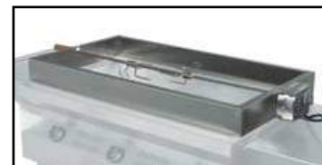
Rotisserie Kit - 36"