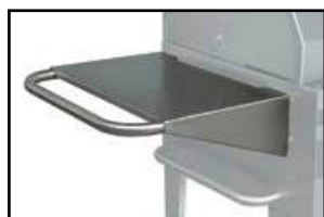
Stainless Steel Side Shelf

Enhance your grilling experience with the BUBBA Q™ Accessories Collection