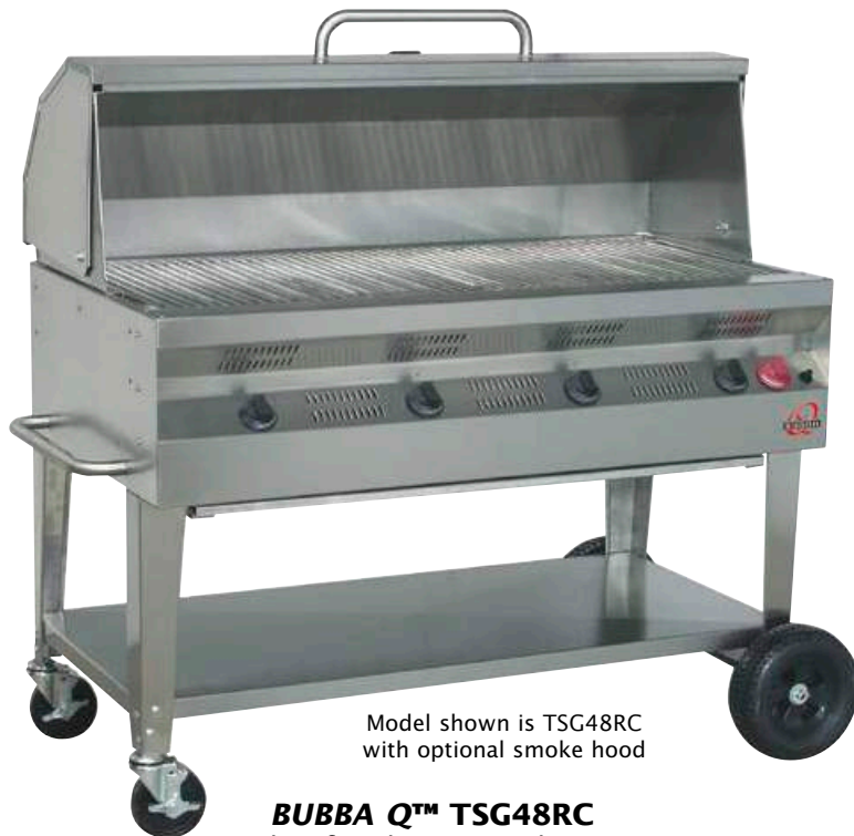
Model shown is TSG48RC with optional smoke hood