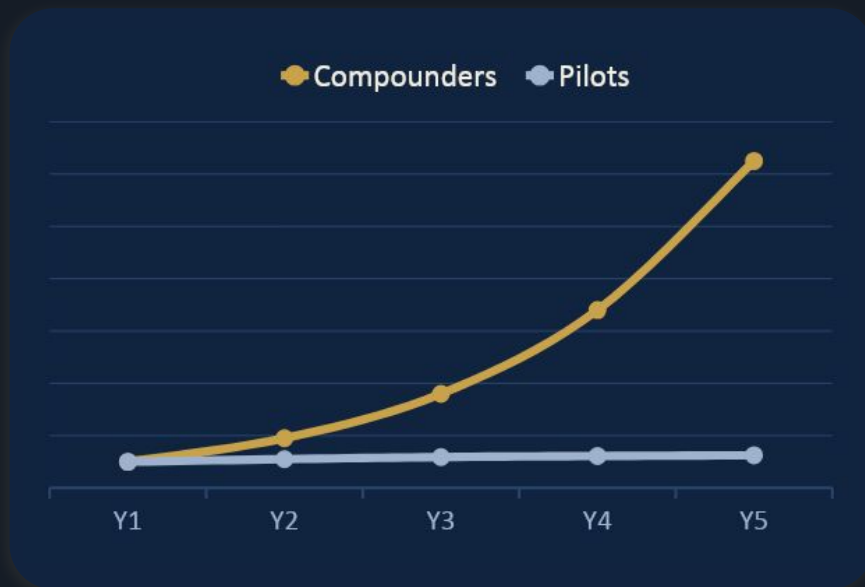
RELATIVE CAPABILITY OVER TIME

The compounding starts now - \square and it does not wait.