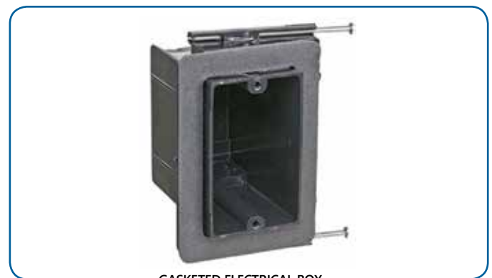
GASKETED ELECTRICAL BOX

Note: To the best of our knowledge, unless otherwise stated, these are typical property values and are intended as guides only, not as specification limits. Chemical resistance, odor transmission, longevity as well as other performance criteria is not implied or given and actual testing must be performed for applicability in specific applications and/or conditions. RAVEN INDUSTRIES MAKES NO WARRANTIES AS TO THE FITNESS FOR A SPECIFIC USE OR MERCHANTABILITY OF PRODUCTS REFERRED TO, no guarantee of satisfactory results from reliance upon contained information or recommendations and disclaims all liability for resulting loss or damage. Limited Warranty available at www.ravenefd.com