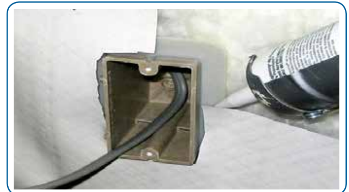
STANDARD ELECTRICAL BOX