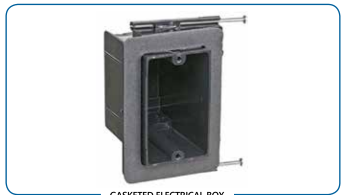
GASKETED ELECTRICAL BOX

Note: To the best of our knowledge, unless otherwise stated, these are typical property values and are intended as guides only, not as specification limits. Chemical resistance, odor transmission, longevity as well as other performance criteria is not implied or given and actual testing must be performed for applicability in specific applications and/or conditions. RAVEN INDUSTRIES MAKES NO WARRANTIES AS TO THE FITNESS FOR A SPECIFIC USE OR MERCHANTABILITY OF PRODUCTS REFERRED TO, no guarantee of satisfactory results from reliance upon contained information or recommendations and disclaims all liability for resulting loss or damage. Limited Warranty available at www.ravenefd.com