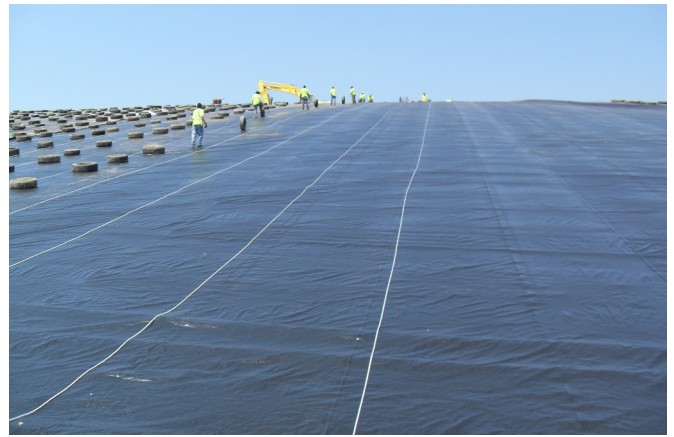
Temporary Rain Shed Cover