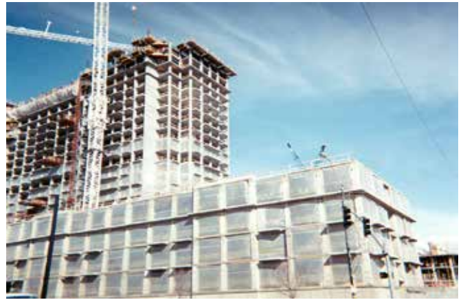
Building Abatement Enclosure

DURA♦SKRIM® 2FR and 10FR stock sizes are 6 and 20 feet wide by 100 feet long; they are also available in a variety of custom widths with minimum order quantities.