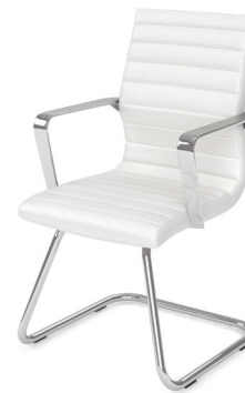
White Leathertek w/Chrome Frame