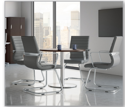
Stylish & Sleek Guest Chair To Accent Any Executive office