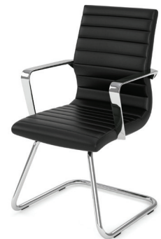
Black Bonded Leather w/Chrome Frame