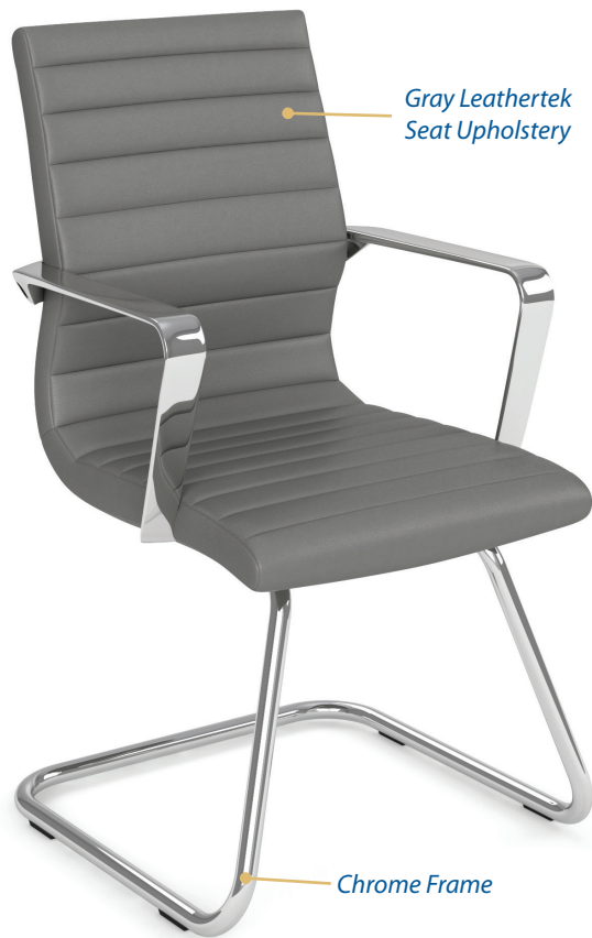
Gray Leathertek Seat Upholstery