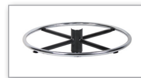
#FRKITBK (Chrome Only)