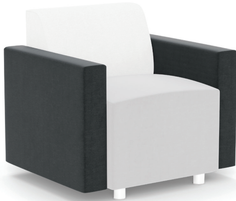
Pictured With (1) #9780