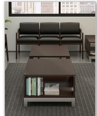
Compliments Any Office Or Lobby Setting Pictured With (3) 1700 Chairs & (3) Designer Half Arms