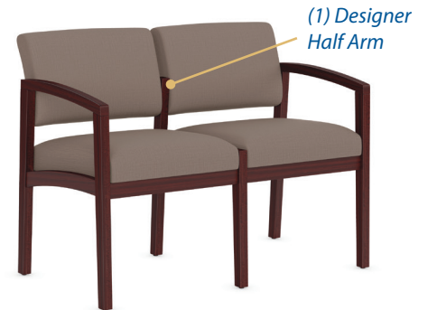
Taupe With Cherry Frame Pictured With (2) 1700 Chairs