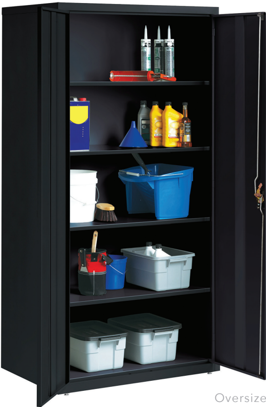
Oversized Storage Cabinet