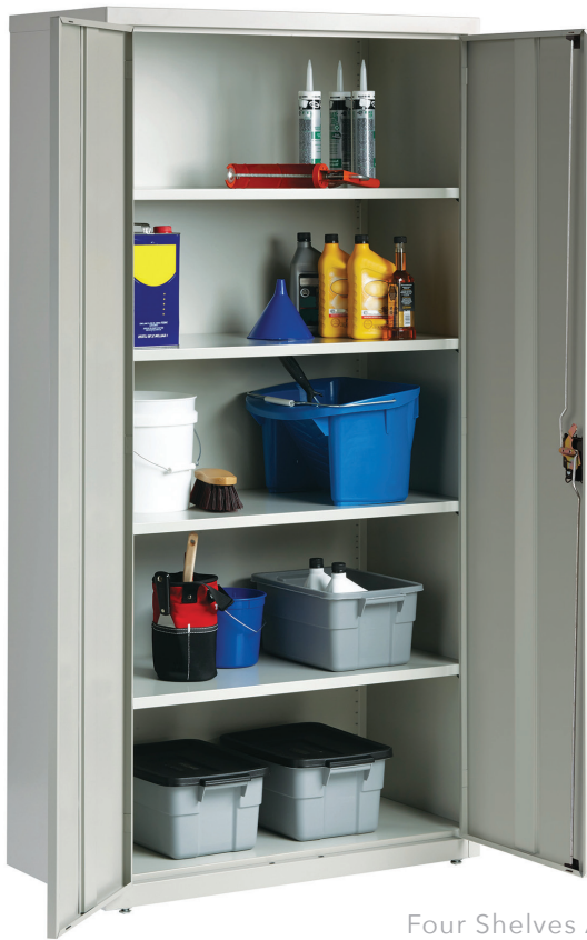
Four Shelves Adjustable In 1" Increments