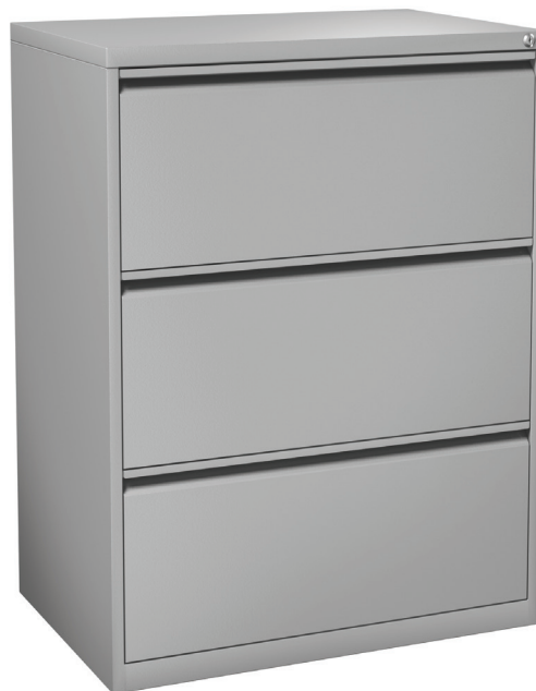
3 Drawer File