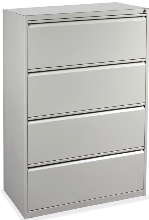
4 Drawer File

Are you having trouble organizing your important documents and files? Although you sort them out, you may still find it a difficult task to locate them later. If this scenario sounds familiar, you should invest in a lateral file from OfficeSource. With its 2, 3, 4 and 5-drawer models, these file cabinets offer sufficient space for accommodating the piles of important files that need sorted and organized. These cabinets come complete with an interlock system, preventing the chances of tipping. The heavy duty design with a full pull drawer system adds sophistication to these essential pieces of office furniture. Crafted with high quality material, these sturdy lateral files are highly durable and will serve you for years to come.