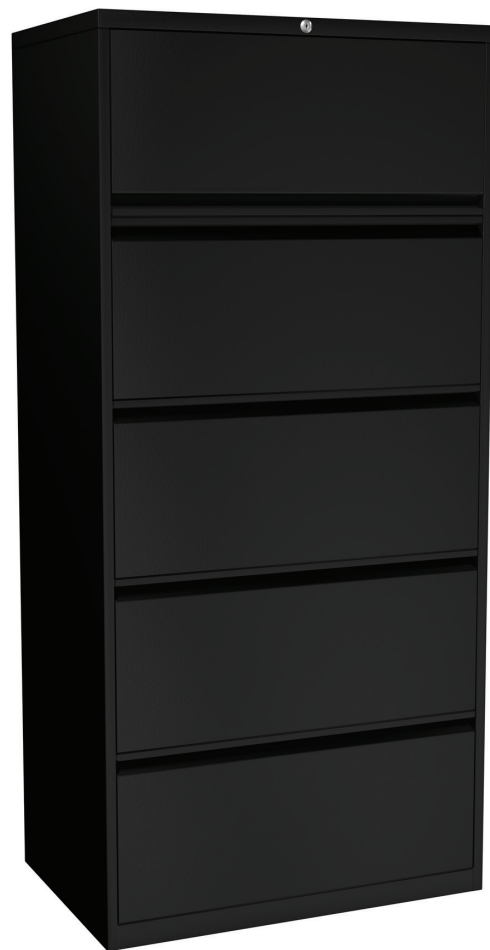
5 Drawer File