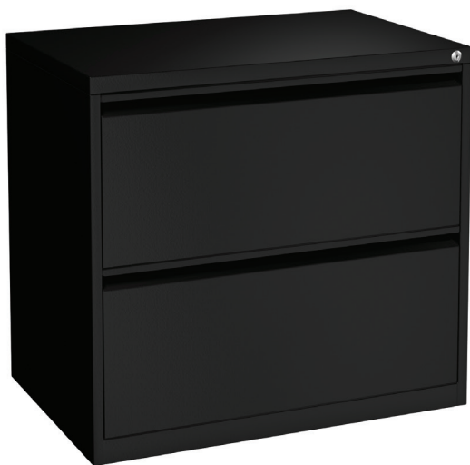
2 Drawer File