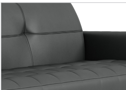
Multi-Layer Foam Seat and Back Cushions