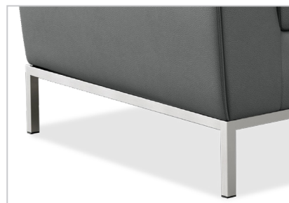
Chrome-Plated Steel Leg Frame