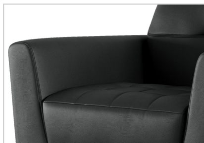
Tufted Upholstery Design on the Cushions & Wide-Tapered Arms