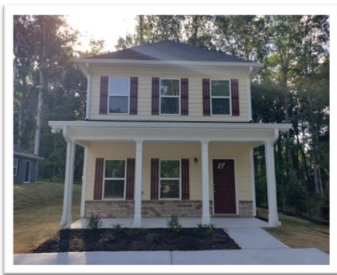
724 Britt Road, Mableton