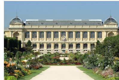
National Museum of History, Paris