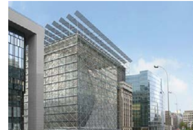
Council of European Union