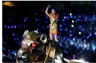
Super Bowl Halftime Show