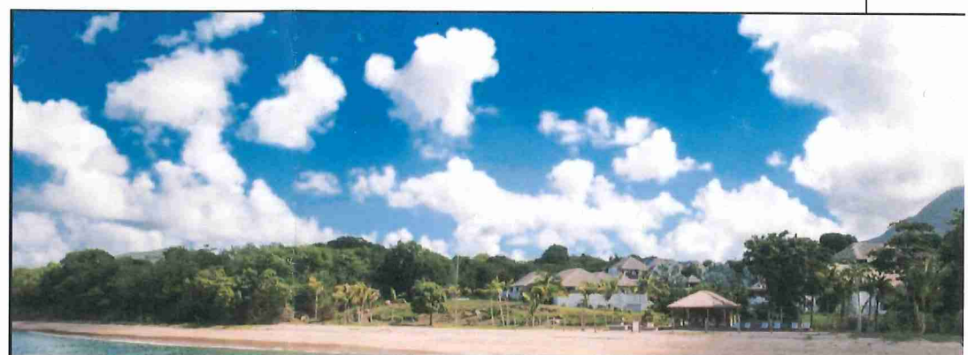
Paradise Beach's seven villas offer on-the-beach luxury in Nevis.

Perhaps the best of all the newly opened Chisholm Trail Parkway's perks is the ease with which it helps to deliver us from the nightmare that is driving I-35 southward to Austin. Jump on the new toll road just west of downtown Fort Worth and follow its 28-mile reach south to Cleburne. There, take Texas 174 west to Meridian and pick up Texas 6, both wide-open, scenic roads that parallel I-35 and lead to Waco. There, you can take I-35 on to Austin, but if the Waco-to-Temple beat-down is a worry, pick up Texas 317 in Valley Mills, just shy of Waco, for an easy, non-interstate route to Temple. You'll be on I-35 from Temple only a short time before you choose one of two smooth-sailing toll roads into Austin, with a total travel time just a smidge over three carefree hours. For toll road info, visit txdot.gov and click on Driver, Travel and Toll Road Systems. For TxTag information, txtag.org . — June Naylor