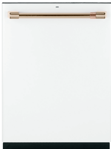
CDT866P4MW2 Matte White with Brushed Bronze handles