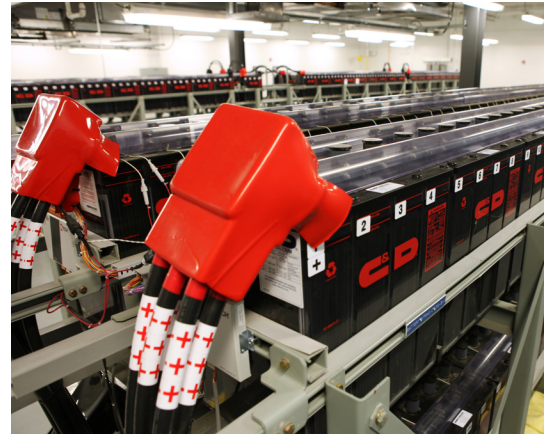
Data center battery rooms help ensure availability and reliability.