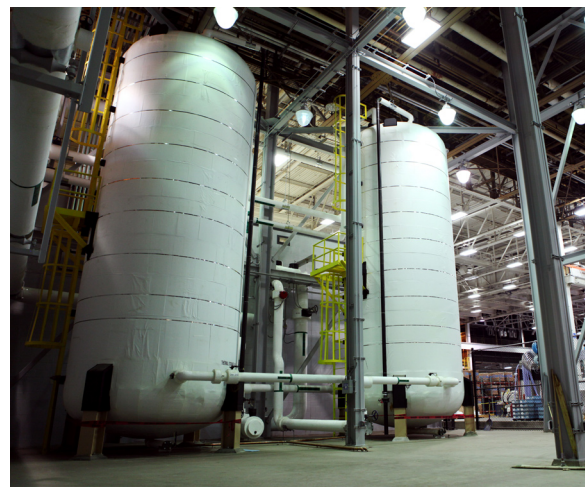
Two 27,000-gallon thermal storage tanks help cool the facility.