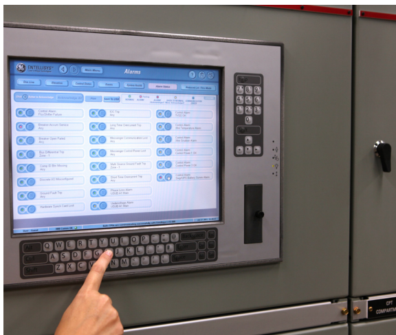
Data center utilizes GE solutions, including Entellisys™ Low-Voltage Switchgear.