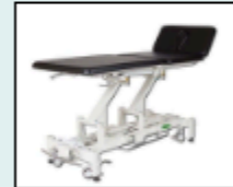
3-SECTION HI-LO TABLE