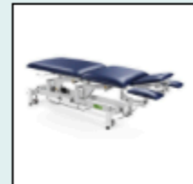
5-SECTION HI-LO TABLE