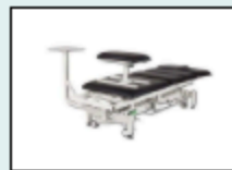
TRACTION HI-LO TABLE W/STOOL