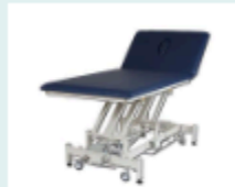
2-SECTION HI-LO BO-BATH TABLE