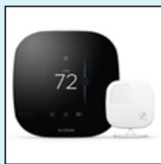
Ecobee3 Thermostat: Apple HomeKit Enabled