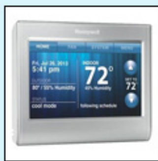
Honeywell Wi-Fi Smart Thermostat