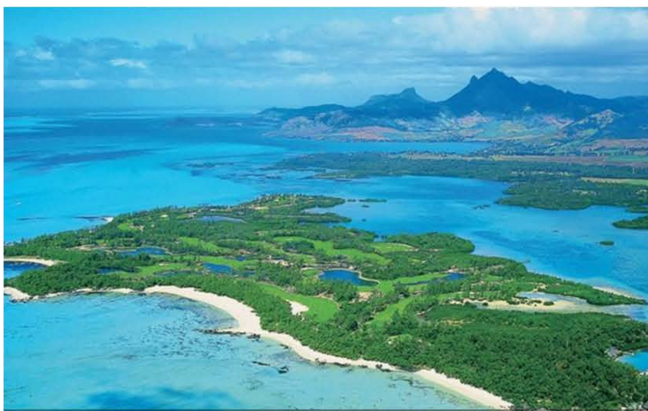
4 reasons to play golf in Mauritius