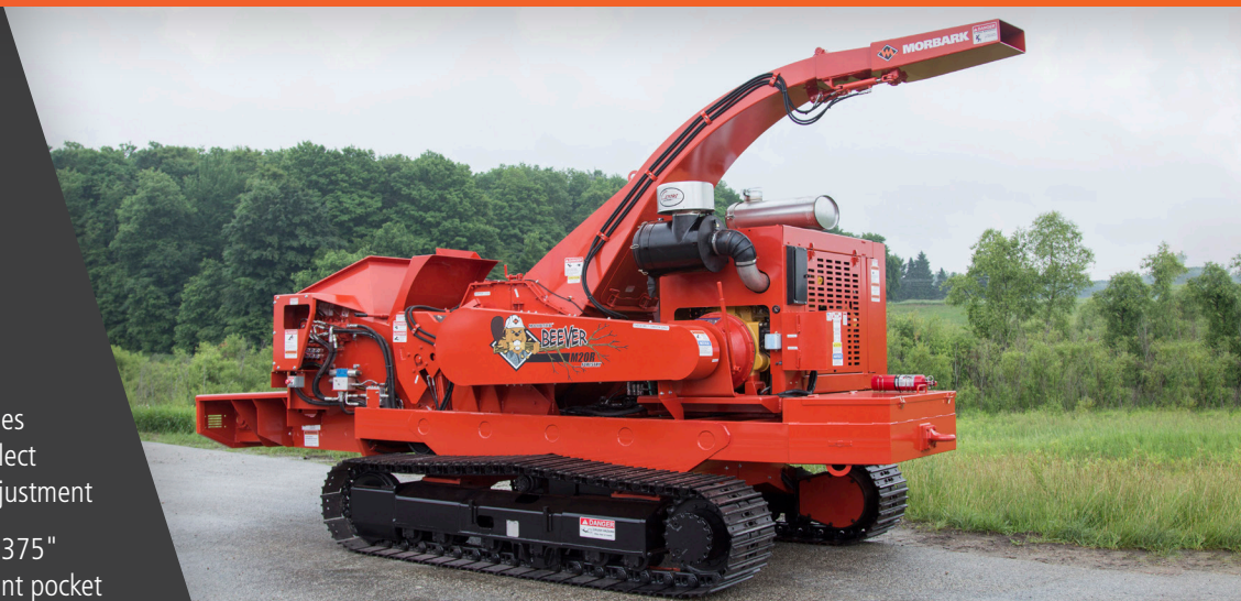
A 6' (1.83 m) infeed bed with live WDH-110 chain drive