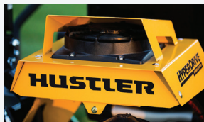
9" Fan & High-Capacity Oil Cooler with Hot Oil Shuttle

Increase the life and performance of your mower with Hustler's exclusive HyperDrive system, the largest, most durable drive system in the industry. With temperature regulation and heavy-duty components, HyperDrive will keep you operating at peak performance.