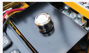
Large Oil Reservoir