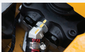
Industrial-Grade Slipper Piston Pumps