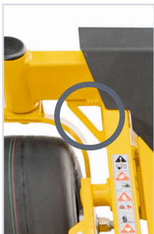
Front & Rear Tie Downs