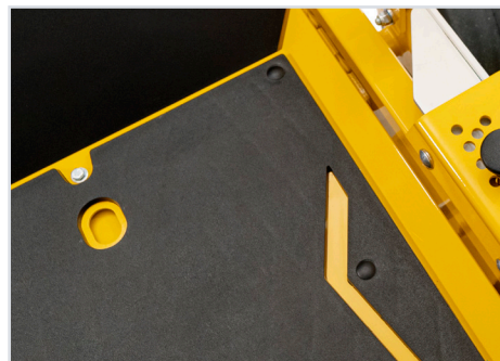
Standard Rubber Floor Mat