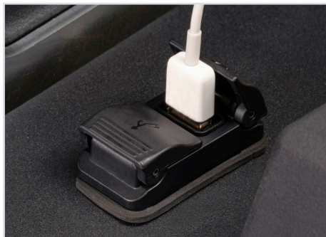
Standard Dual USB Port