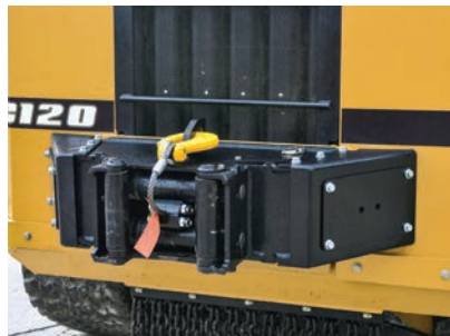
Hydraulic rear winch with 12,000-pound capacity.