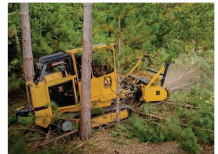
Purpose-Built Forestry Mulcher