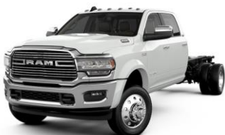
Ram 45/5500 Chassis