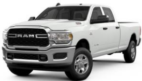
Ram 25/3500 Pickup