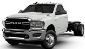
Ram 3500 Chassis