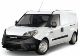
Ram ProMaster City