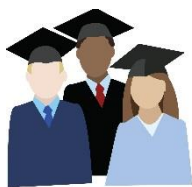
Student Loan Fund

committee is now accepting applications for Student Loans. Pick up an application at the church office and return by May 19, 2019. Applicants must be members of Bellevue or family of members. Funds are limited, but we evaluate