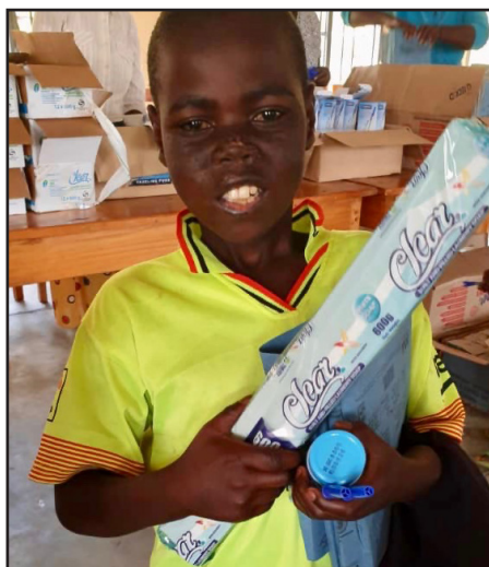
Fraterine at Bible class on May 11