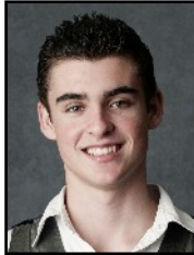
Preston Calquhoun Home School and Centralia College