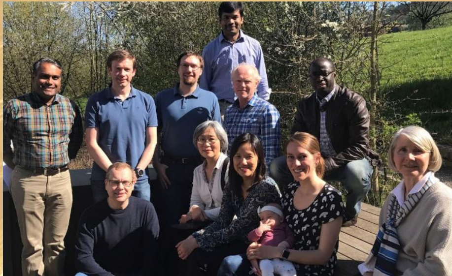
2017 IPC Council photo