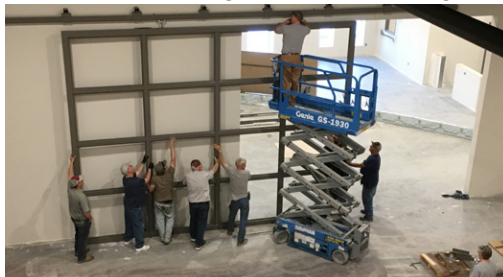
Progress at the Building Site

There are a limited number of Life Change Camp Scholarships available for the summer of 2018. If you are interested, please contact the church office.