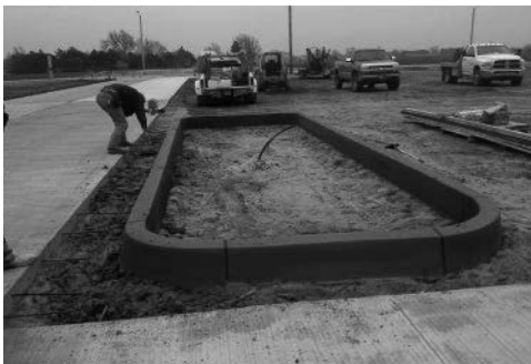
Concrete work continues on the parking lot.