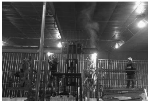
Building the mezzanine.