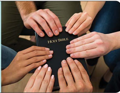
TABLE OF BLESSING

PHASE 1 - 270,000 BIBLES Reaching all secondary schools