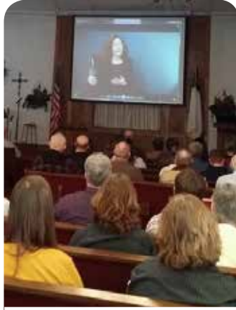
RHN Annual Board Meeting