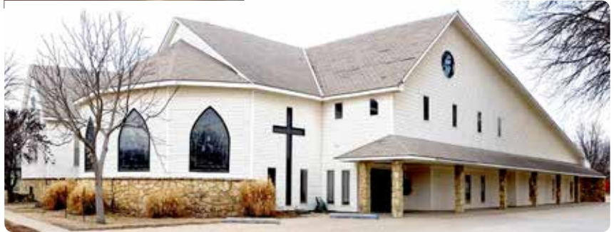
Documentary Screening and Seminar - Council Grove, KS