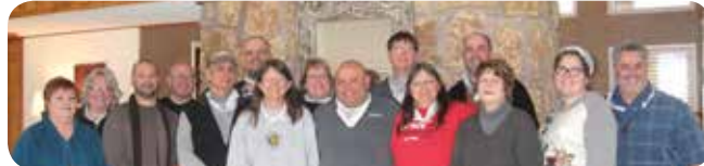
FSM Volunteer Leadership Retreat

Southern Baptist Leaders Conference - Lawton, OK