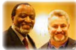
DC Leadership Meeting w/ Alan Keyes