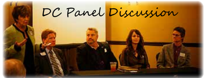
DC Panel Discussion