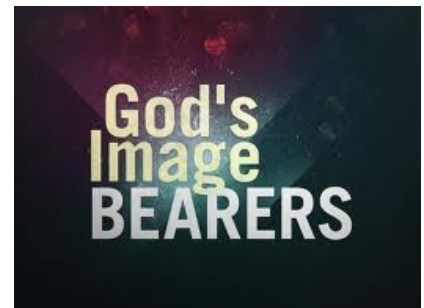
Image Bearers will continue to meet on Sunday evenings through May 5th. Our only night “off” will be on Easter Sunday evening, April 21st.