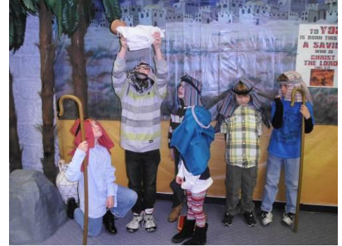
Photo: Simeon recognizes baby Jesus as the long-awaited Savior. He lifts the Baby to the heavens and thanks God that the Savior is born!

On Epiphany, we talked about the Wise Men coming to worship Jesus. King's Kids shared reasons why THEY worship Jesus: "because He made the world"; "because He gives us food and water"; "because He takes care of us"; "because He came to be the Savior"; "because He loves us". . . As kids quietly wrote their responses on a paper crown, I could sense that there was JOY in Heaven as God heard the praises of His "little" ones!