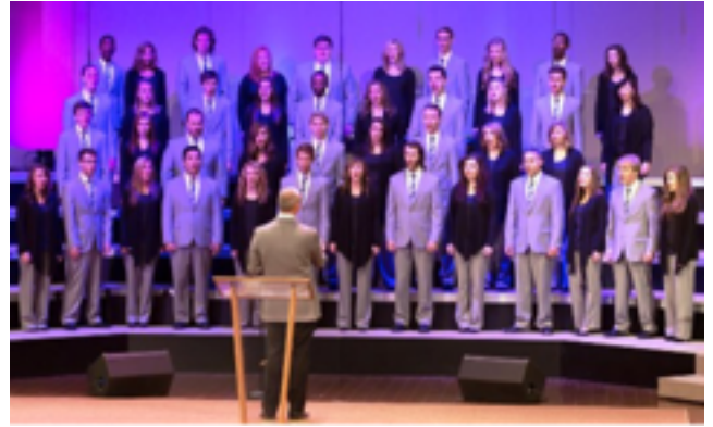
The Lee University Singers will be joining us for worship on Sunday, January 28, 10:30am