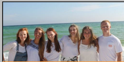
RUF "Contingent" at RUF Summer Conference in Panama City

This would have been really bad news to the 4 international students from UT and the 1000 other college students from across the U.S. who attended last week's RUF Summer Conference in Panama City, Florida! They thoroughly enjoyed the sight and sound and feel of the sea! And on top of lots of fun, they also experienced Christian worship, heard great teaching, and had time to reflect on life alone and with others.