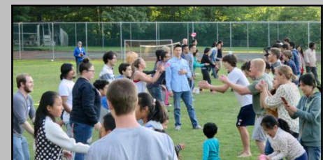
RUF "Finish Line" Party

It was a beautiful and warm May evening. We enjoyed a great feast, a "kaleidoscope" of cultures , the joy of conversation among friends, plenty of games, good music, and...of course...fireworks (no stray Roman candles this year!). Some sad goodbyes, but a special ending to a great year!