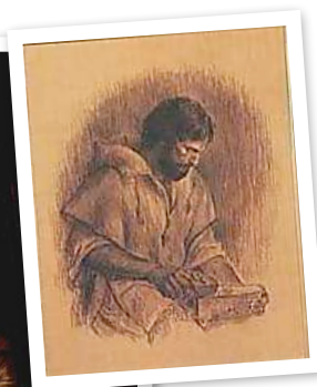
Jesus the Carpenter by Frances Hook, item #240, for sale online