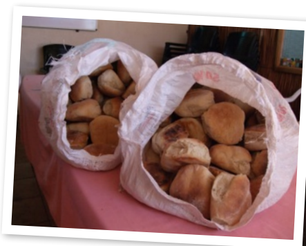
This pic is from Mozambique. These Portuguese bread rolls are what we fed over 330 children...and yes, God made sure every child had their own!