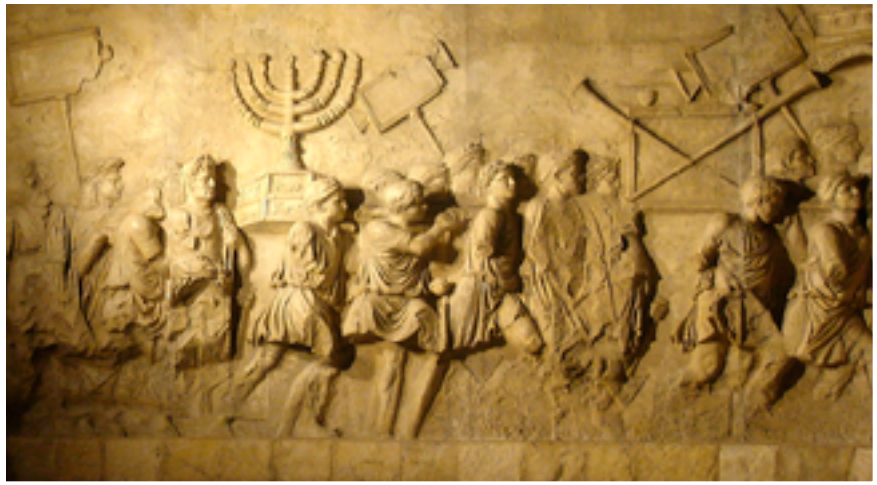
Above: The sack of Jerusalem, from the inside wall from the arch of Titus, Rome